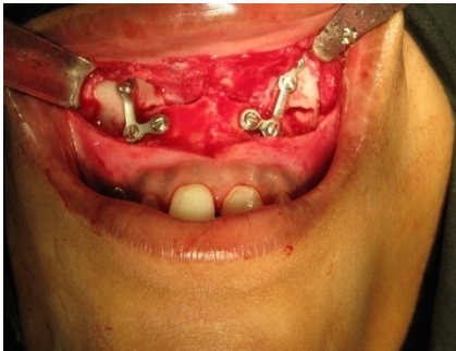
Anterior maxillary osteotomy – Orthognathic surgery was done